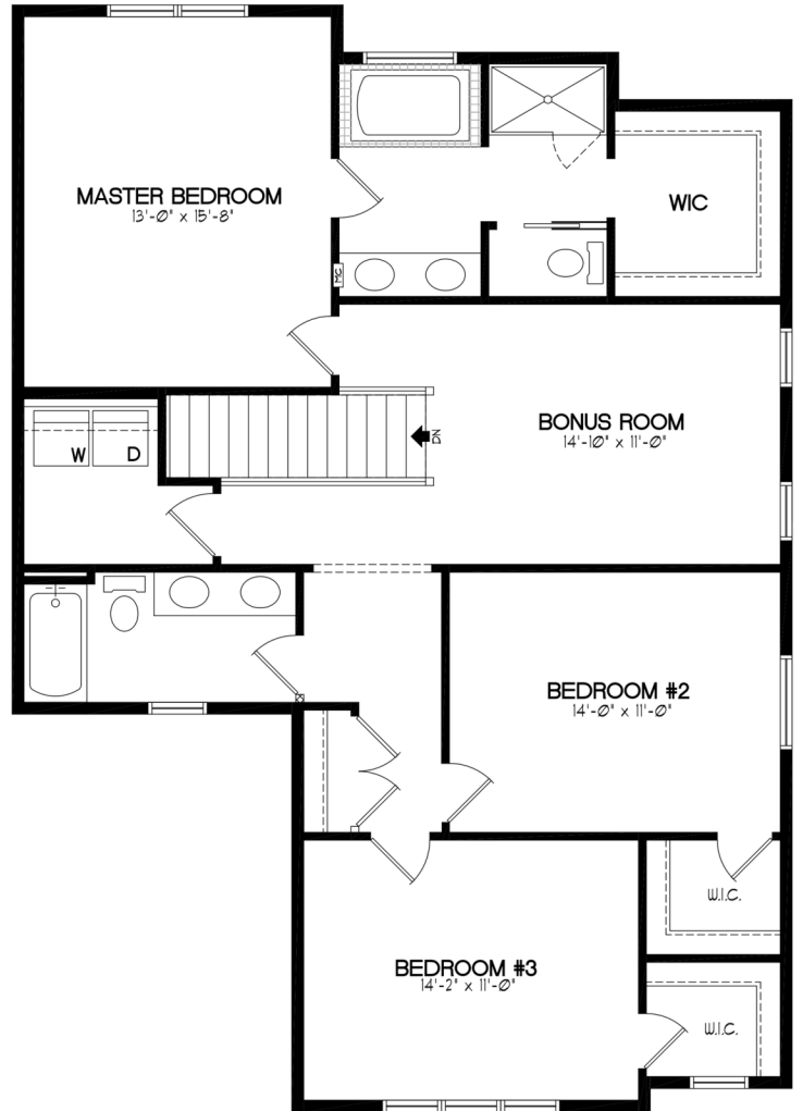
UPPER FLOOR - 1249 SQFT

Broadview Homes reserves the right to change plans, features, and specifications without notice. Prices are subject to change without obligation or notice. Square footage is approximate. Elevations, features, and square footages may vary by area.