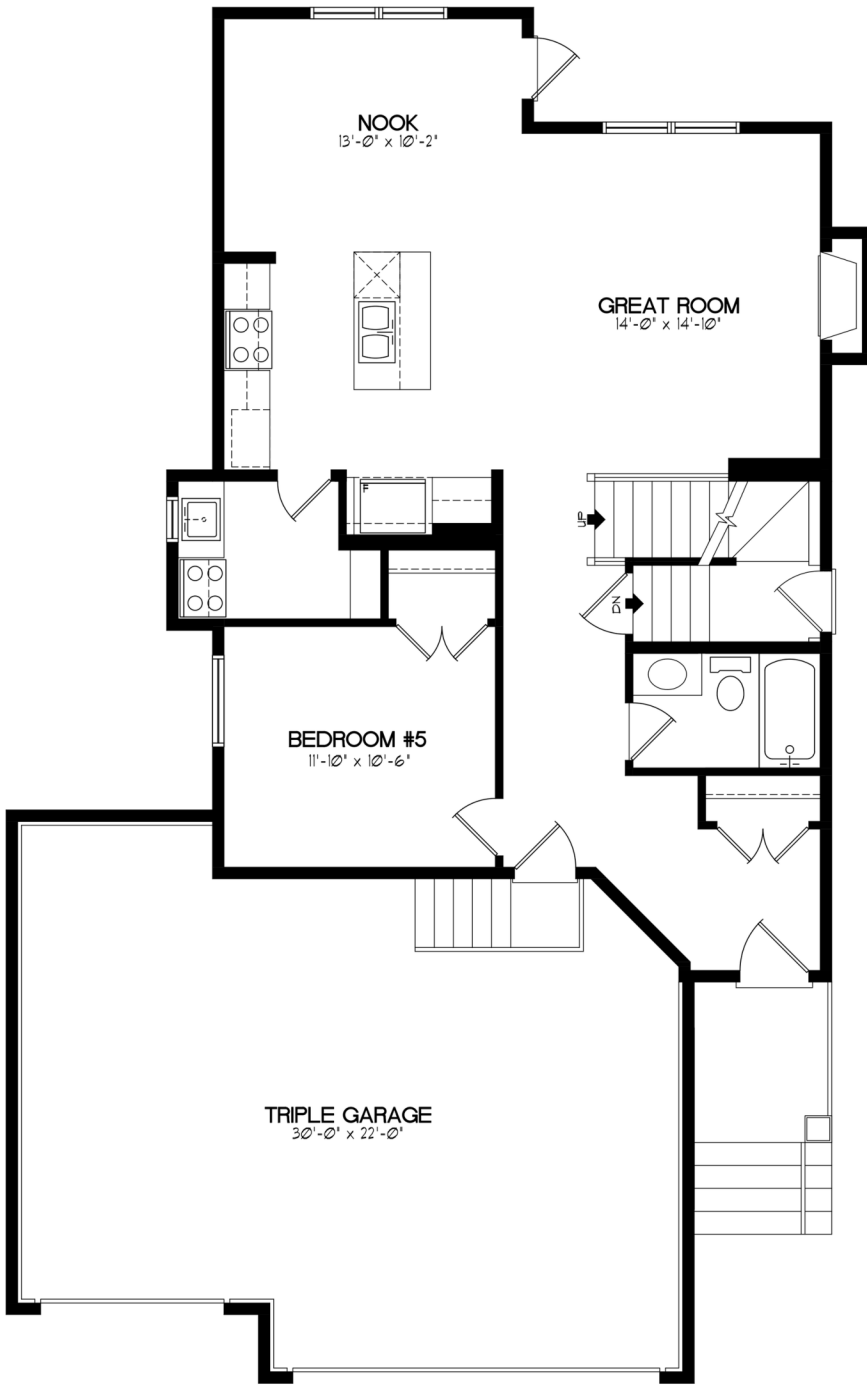
MAIN FLOOR - 1012 SQFT