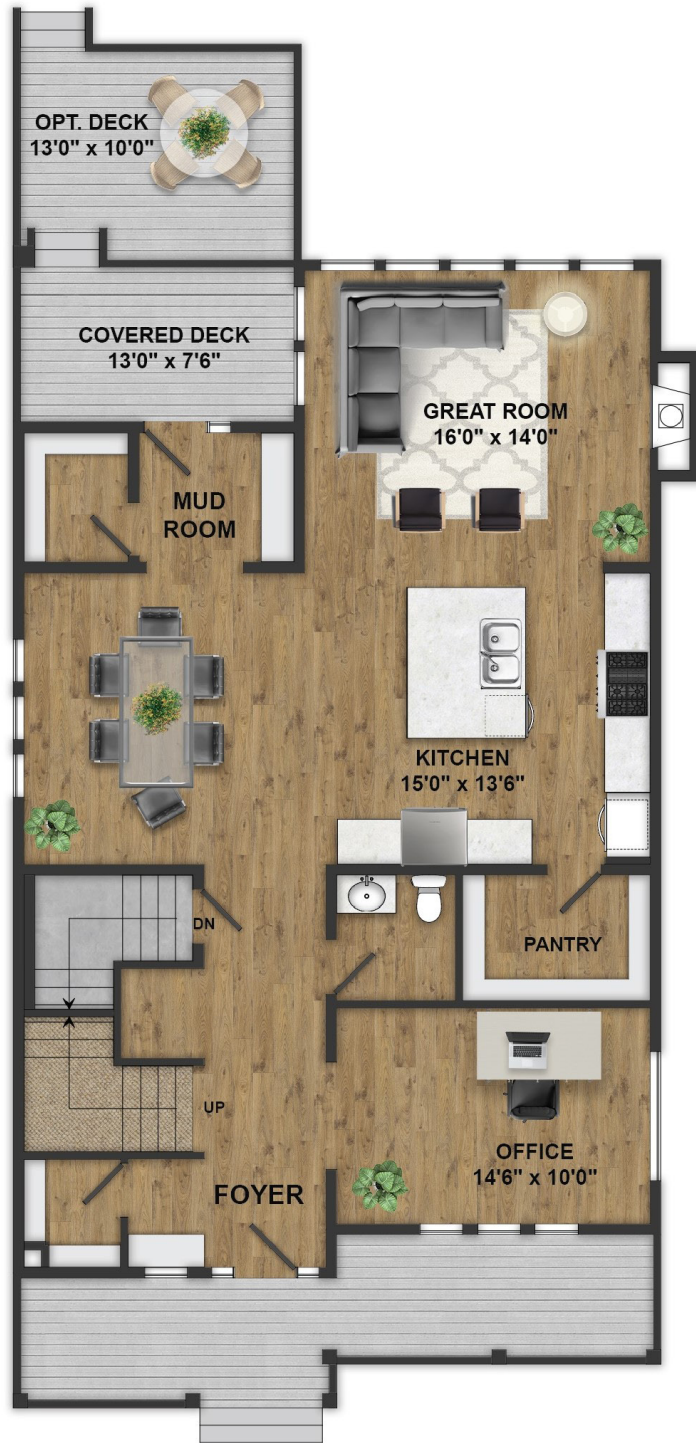
MAIN FLOOR - 1288 SQ. FT.

The Homestead is a fresh new plan, with plenty of space for everyone. This two Storey home has 3 Bedrooms and 2.5 Bathrooms. The home features an open concept main floor with a large Kitchen, Dining Nook, Great Room and a spacious Office, all topped off with a gorgeous Open-to-Above Foyer and Covered Porch. A spacious Master bedroom with large dual Walk-In Closets and 5-piece En-Suite, two additional large Bedrooms, and second floor Laundry Room create an upstairs retreat for everyone.