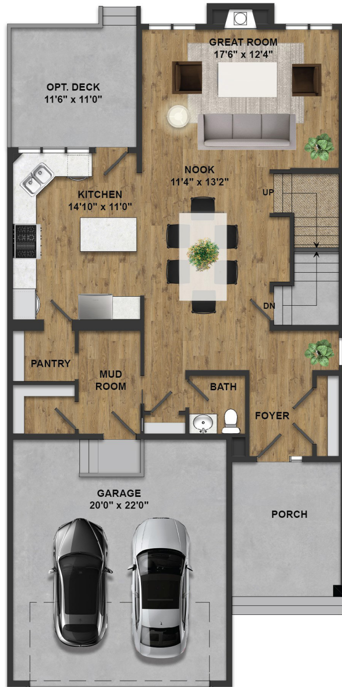
MAIN FLOOR - 1005 SQ. FT.

Upstairs the central Bonus Room is a hub between 2 secondary Bedrooms, main Bath and Laundry Rooms, and the private Master Suite with over-sized En-suite and huge walk-in-Closet.