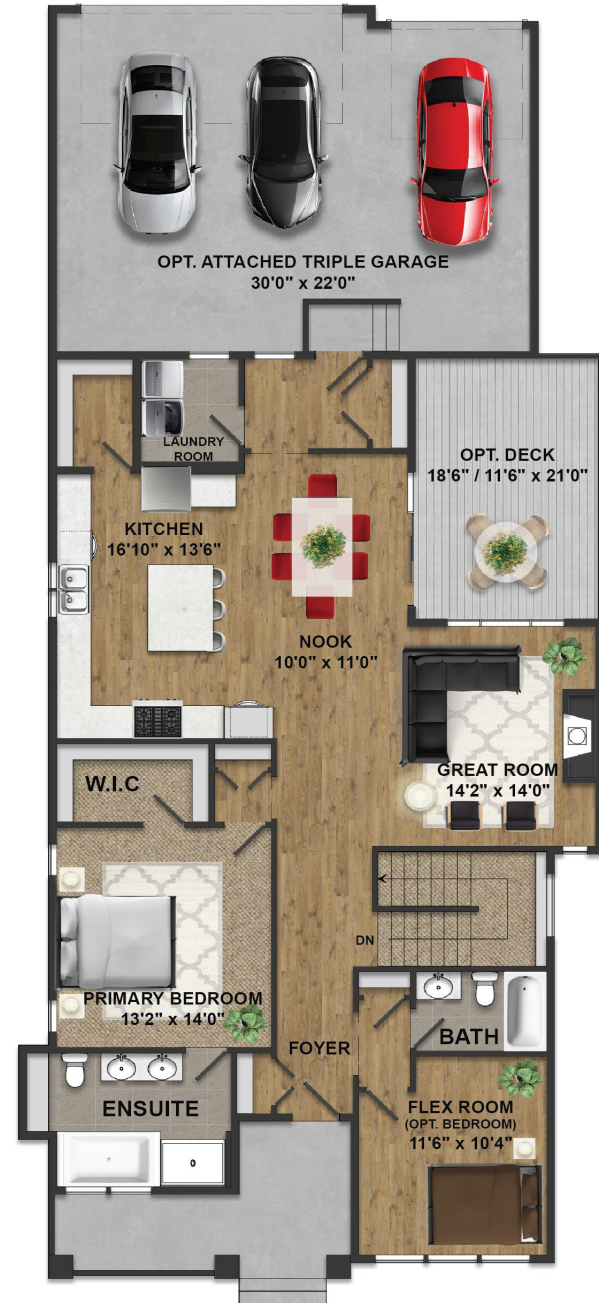
MAIN FLOOR - 1597 SQ. FT.

This charming bungalow can pull off any of Harmony's architectural styles, from Arts & Crafts to Farmhouse and Contemporary.