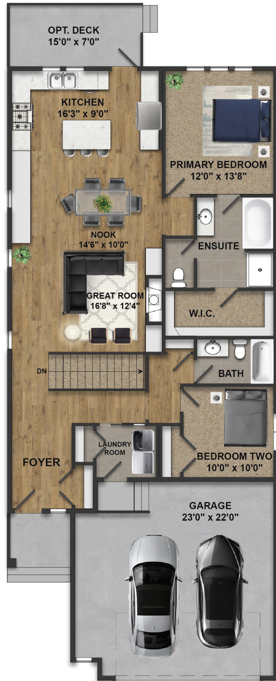
MAIN FLOOR - 1415 SQ. FT.

The Bennett is a spacious open concept 1415 square foot Bungalow with 2 bedrooms on the Main Floor and the option to develop the basement, adding 2 additional bedrooms and full bath. With a welcoming Foyer, you are greeted by a spacious Great Room, Dining Nook and Kitchen, Contemporary fireplace, and an oversized double car garage.